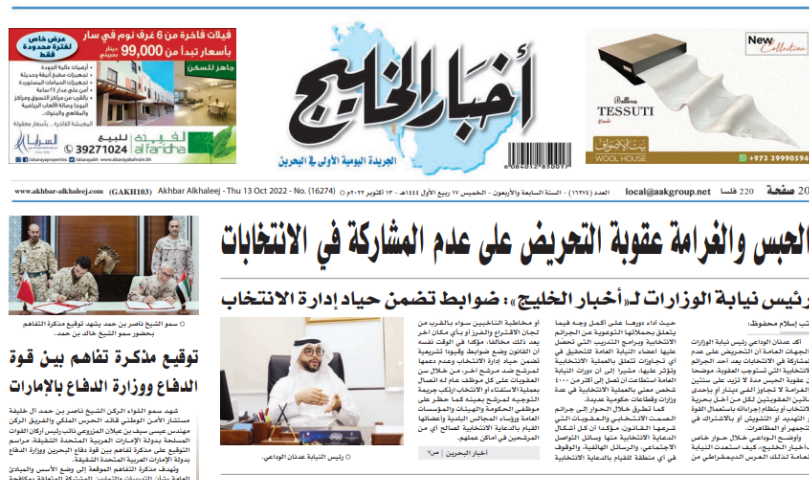
Figure 2: Local newspaper frontpage headline featuring threats on calling for election boycott

punishment by the law. 72 Authorities are calling for participation in the election by promoting slogans such as “performing national duties guaranteed by the constitution.” 73